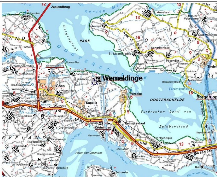
Map 2 / By car you easily reach Wemeldinge via the A58 highway running from Roosendaal / Bergen op Zoom to Middelburg or follow the Oosterschelde, from the direction of Zierikzee.