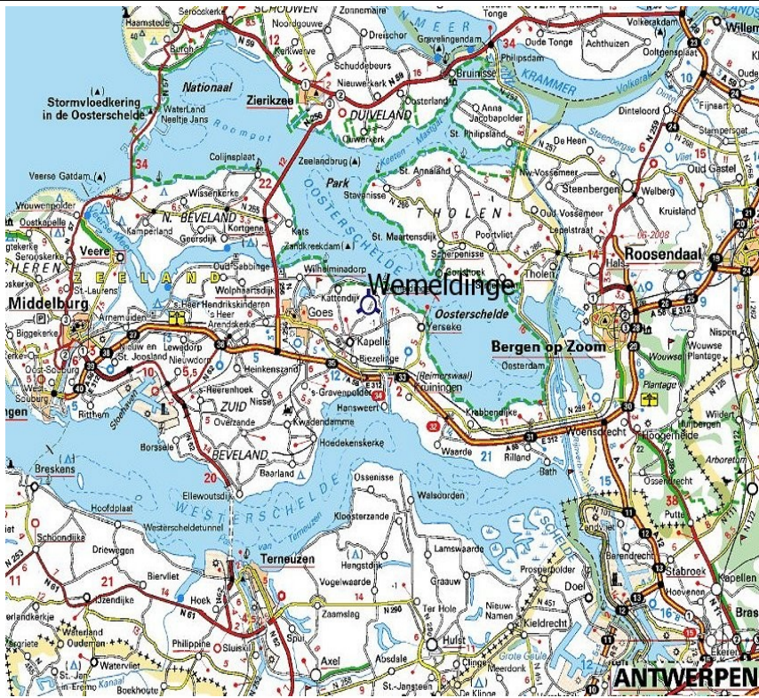
Map 1 / Wemeldinge is located in the heart of Zeeland close to the Oosterschelde, at 60 km distance of Bergen op Zoom and 35 km distance of Bergen and Middelburg in Brabant and Middelburg and Vlissingen on Walcheren.

Tel. 0113-621294 Mob. 06-25092508 Www.derderonde.nl